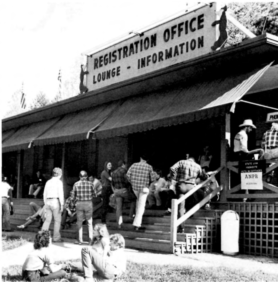
The front porch of Fontana's Rec Hall, a prime gathering spot during meeting breaks.